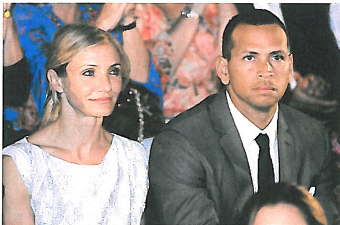
New York Yankees slugger Alex Rodriguez, seen here with girlfriend Cameron Diaz, has agreed to purchase a 3,600-square-foot penthouse in The Rushmore building. Yankee slugger Alex Rodriguez is changing bachelor pads. A-Rod has agreed to purchase a 3,600-square-foot penthouse in The Rushmore building on the upper West Side.

Access Hollywood Actre Idol Bata Beverly Hills Charlie Sheen Christmas Co Star Dad Daily Dose Dancing With The Stars Divorce Facebook Fans Glee Hollywood Hubby Insider Jersey Shore Justin Bieber Kim Kardashian Lady Gaga Lindsay Lohan Love Marriage M Cyrus Mom Mtv New Year New York City Parents People Photo Reality Show Red